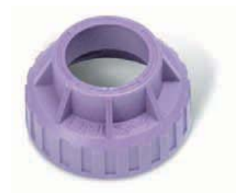
Optional UNI-Spray™ Non-Potable Cover (page 33)